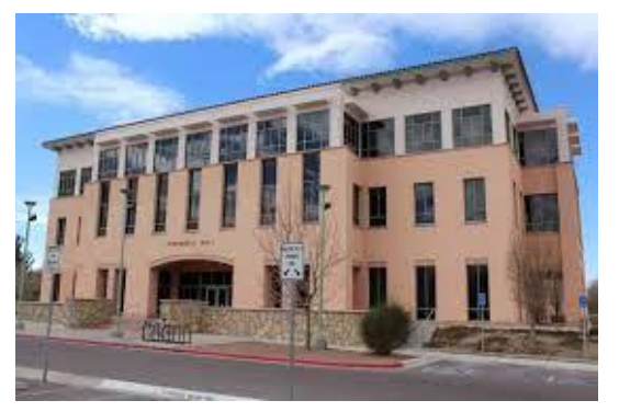
1220 Stewart St.